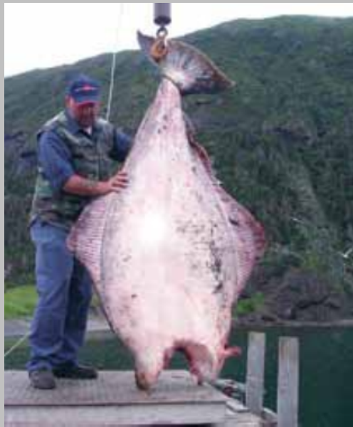
A fisherman in Bottle Cove, Newfoundland, with a freshly caught halibut.